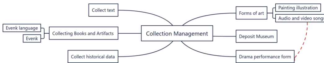
Figure 2. Example of protecting Evenki culture