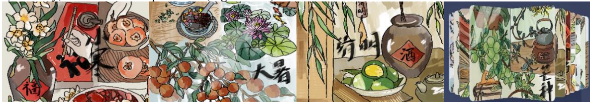
Figures 1-4: Part of the picture book design content

In the practical teaching cases of protecting traditional Chinese culture, teachers mainly start from the main carriers and contents of traditional culture. By integrating the curriculum with traditional festivals, solar terms, local cultures, and folk arts, traditional culture is promoted and inherited in the early childhood education stage. [6] Based on this, this picture book selects solar terms and festivals closely related to children's lives, designing themes around the twenty-four solar terms and festival cultures, hoping that children will gradually experience the changes and transitions of traditional culture and solar terms through visual, auditory, and hands-on experiences (Figures 1-4).