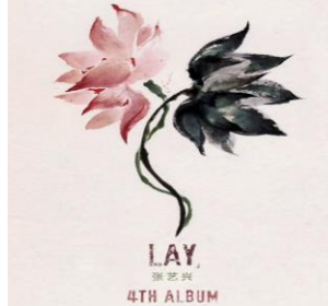
Figure 1 Zhang Yixing "Lotus" Album Cover

other, making it clear what the songs convey. Zhang Yixing's "Lotus" is also an excellent example of a Chinese pop album (Figure 1). On the cover of this album, a traditional Chinese ink painting of a water lily is used, and "Lotus" is meant to represent the uncommon temperament and unruly spirit of the lotus flower that "comes out of the silt and does not get stained" in traditional Chinese culture. The album cover consists of two intertwined black and red lotuses, blooming together, alluding to the concept of "Lotus is born from two sides" (baijiahao 2020). The album cover shows the Chinese character of the music and suggests that the song's main character is the same as the lotus flower. Therefore, a unique album package is attractive to the audience and can enhance consumers' desire to buy (Cheng 2019). Music albums with distinctive features, prominent concepts, and satisfying consumers' aesthetic experiences will catalyze the cross-cultural dissemination of Chinese pop music.